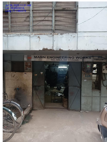
Site Exterior Picture