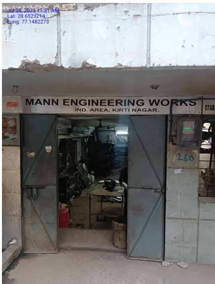
Site Exterior Picture

Information contained in this section is as provided by the applicant MSME, relevant to the requirements contained in this Certification Level. The Photographs depicted are geo-tagged & time-stamped and have been uploaded by the applicant through the ZED online systems.